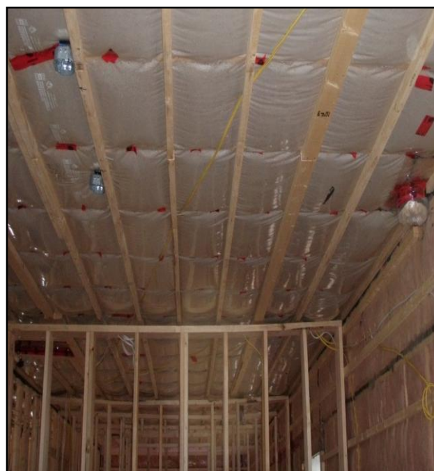
Figure 1 – Attention to detail when sealing the vapour barrier will pay off when they move back in.

Arctic Energy Alliance performed a blower-door test during the mid-renovation evaluation. Based on the air sealing alone, estimated savings of over $1,000 per year are projected.