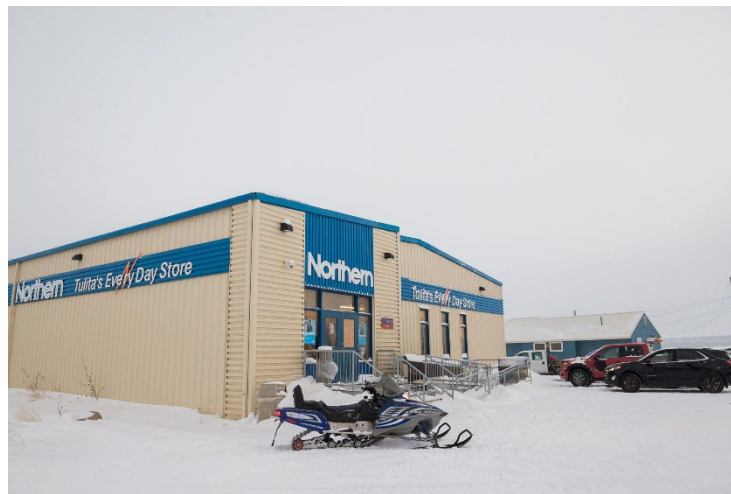
The Northern Store in Tulita