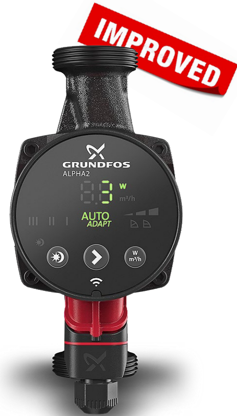
Grundfos Alpha 2