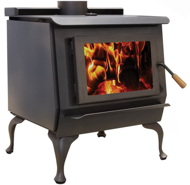
Blaze King Princess 32